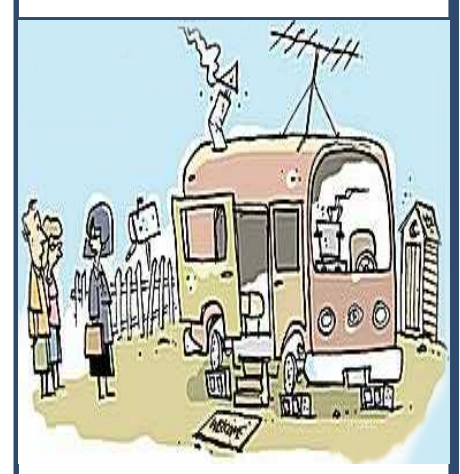
What? You wanted to see something in the $150,000 range didn't you?